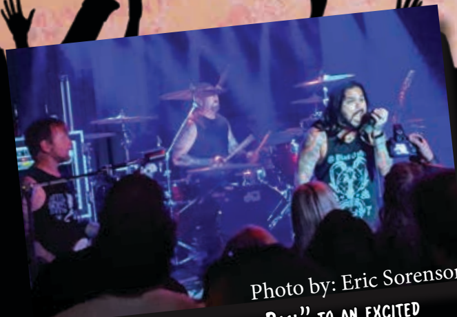
NEP BRINGS "DROWNING POOL" TO AN EXCITED SHREVEPORT AUDIENCE